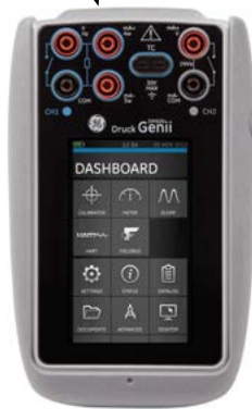
Measure and source mA, mV, V, ohms, frequency, RTD's and thermocouples