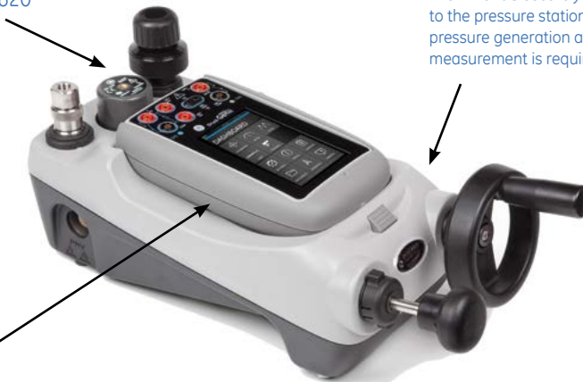
PV62XG Pressure Station. The DPI620G securely attaches to the pressure stations when pressure generation and measurement is required