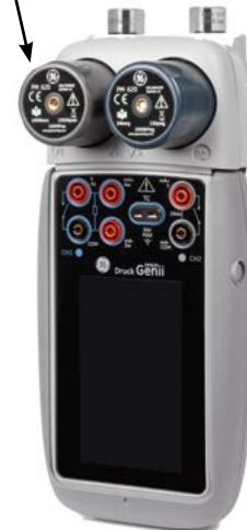
Re-rangeable dual channel pressure measurement from 25 mbar (10 inH 2 O) to 1000 bar (15000 psi)